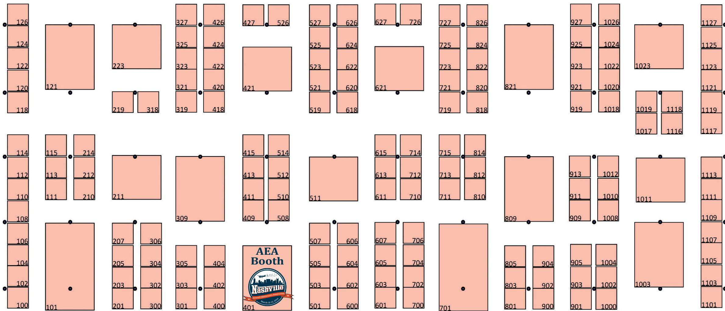
Entrance to Ryman Exhibit Halls, B3-B6